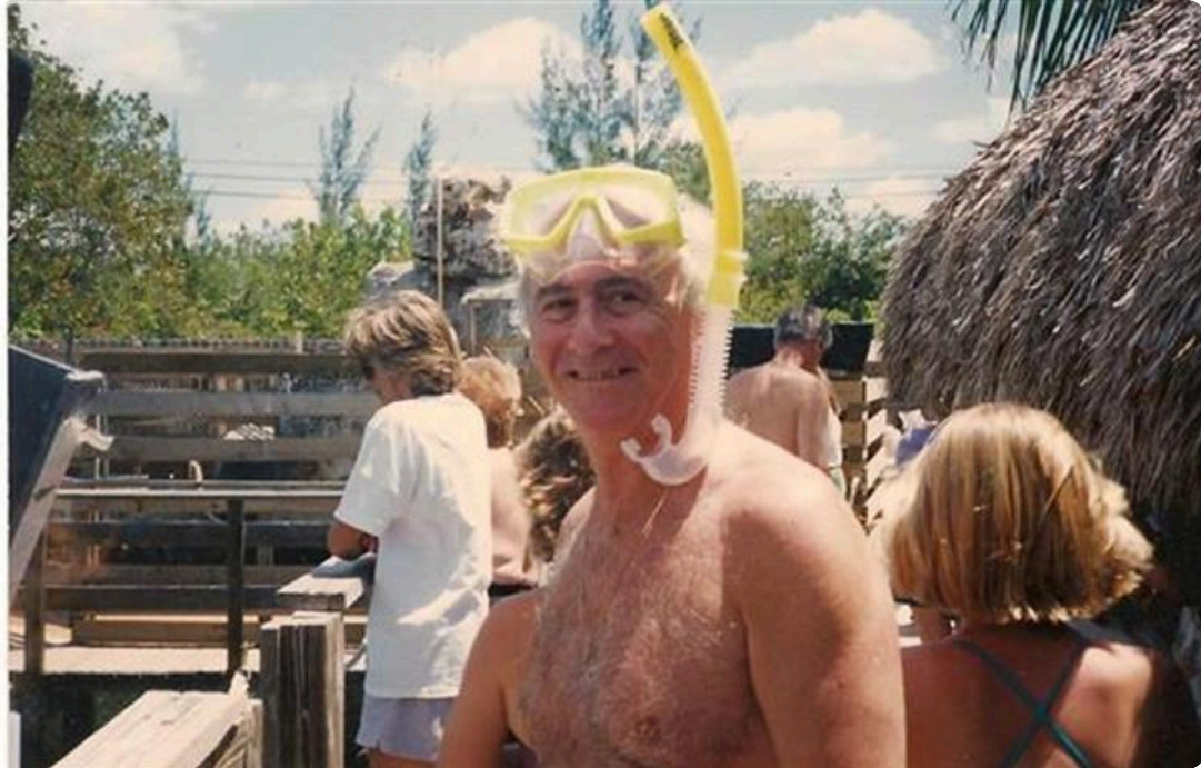
Bond. James Bond ...