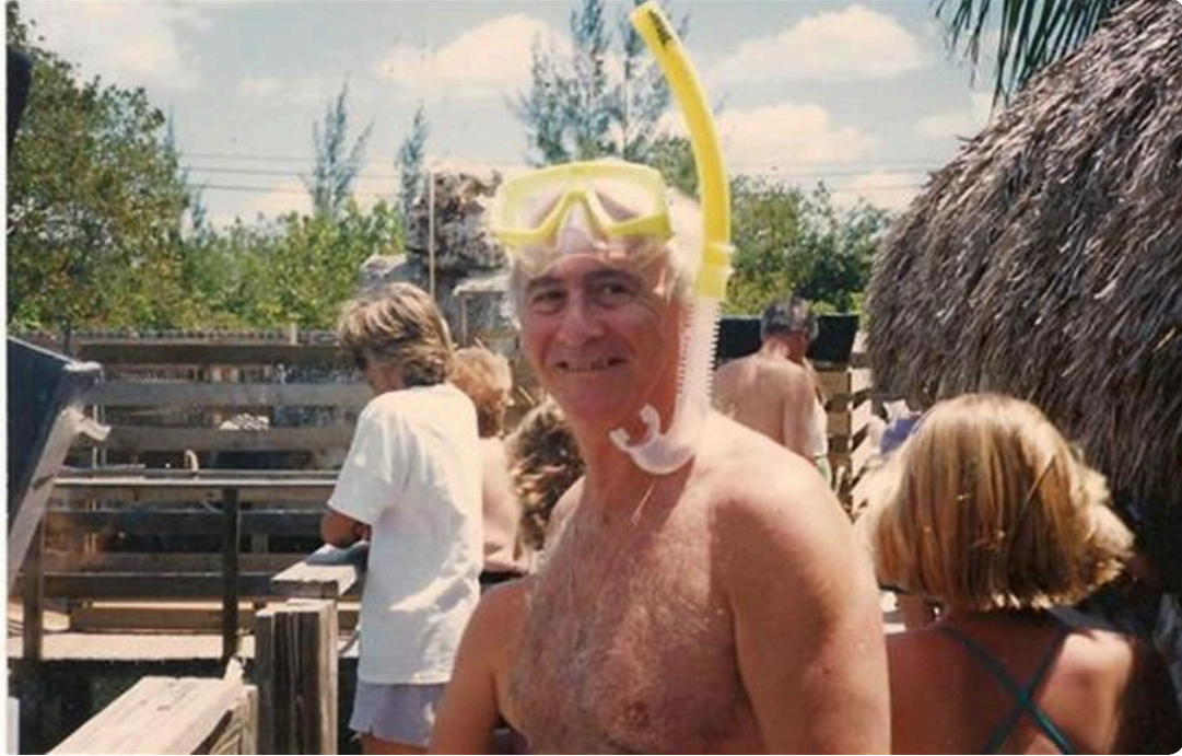
Bond. James Bond ...